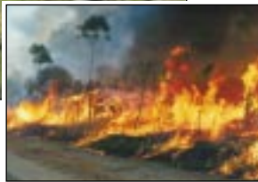
These burnt pastures (on the hills) in Eastern Indonesia emphasises the seriousness of catchment management in the region.