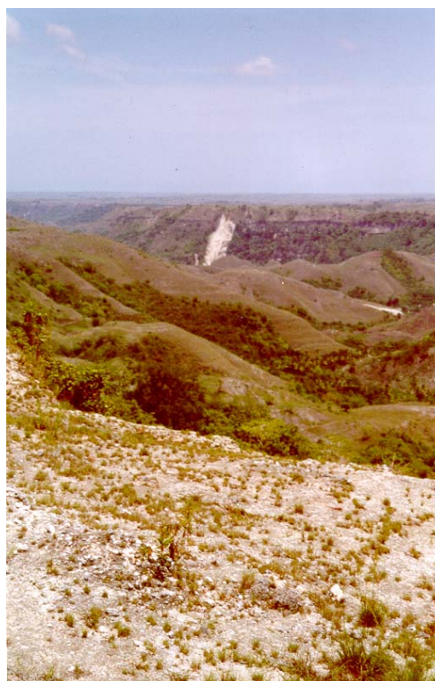
Inland Sumba comprises a dissected limestone plateau. This view features a landslide that occurred in the 2002/2003 wet season.

*Australian Centre for International Research (ACIAR) is an Australian Government statutory authority that operates as part of Australia's Aid Program within the portfolio of Foreign Affairs and Trade. It contributes to the aid program objectives of advancing Australia's national interest through poverty reduction and sustainable development. For information on ACIAR see http://www.aciar.gov.au/ .