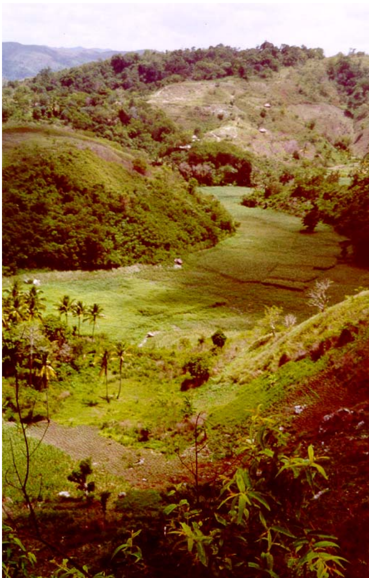
A view from a hill adjacent to a participating village, Luku Wingir, Sumba. The planted area nestling among hills was a spring-fed lake in the 1980s. Erosion, in part due to vegetation loss as a result of unmanaged fires, has now completely filled the lake.