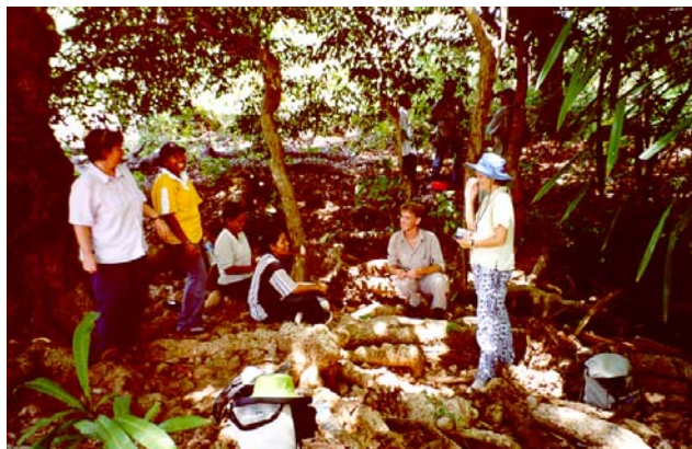
Project team members from Darwin, Flores and Sumba chat in a shady rainforest patch, surrounding a spring at Luku Wingir, Sumba