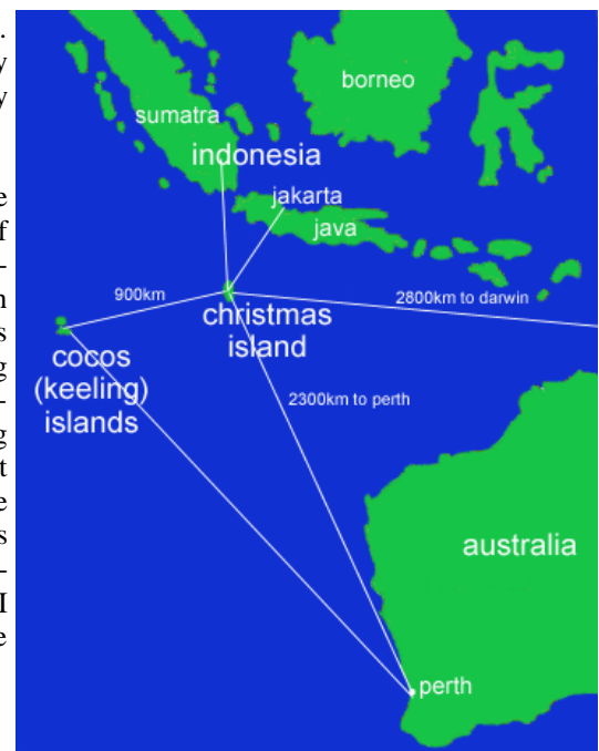
Location Map

This is a view of 'Flying Fish Cove' where most of the activity occurs. The structure at the bottom of the cove is the jetty. At the top of the photo are two structures called the 'Cantilevers' that are used to load ships with phosphate from the storage warehouses. Bottom right is the 'Kampong' where the majority of the Malay population live.